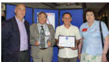
The 2010 National Club of the Year competition was won by Reading & District Amateur Radio Club.