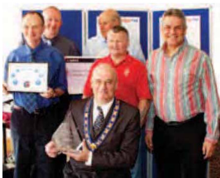
The first National Club of the Year winner, in 2009, was Cheltenham Amateur Radio Society.

If you haven't yet decided to join the regional competition it is not too late – the closing date for entries is 31 January 2011. This is a golden opportunity to get your club on the map and, through team work, your club to could hold the prestigious title of National Club of the Year.